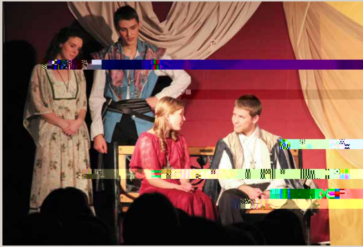
Campus Blood Drive